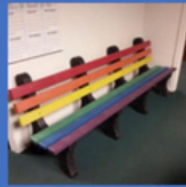
Green Tree Plastics recycle plastic caps into a Buddy Bench

No one goes through water like runners! Don't forget to save those caps for the buddy bench program! Bring them to the Strider Family Party or any of the runs!